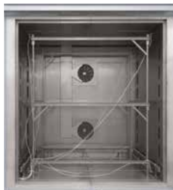
Pluggable frame for measurement for forced convection chamber furnace N 7920/45 HAS