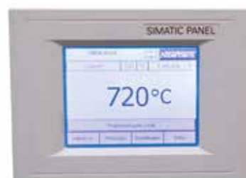
Precision of the controls, e.g. +/- 1K

In standard furnaces a temperature uniformity is guaranteed as +/- K without measurement of temperature uniformity. However, as additional feature, a temperature uniformity measurement at a reference temperature in the work space compliant with DIN 17052-1 can be ordered. Depending on the furnace model, a holding frame which is equivalent in size to the charge space is inserted into the furnace. This frame holds thermocouples at defined measurement positions (11 thermocouples with square cross-section, 9 thermocouple with circular cross-section). The temperature uniformity measurement is performed at a reference temperature specified by the customer at a pre-defined dwell time. If necessary, different reference temperatures or a defined reference working temperature range can also be calibrated.